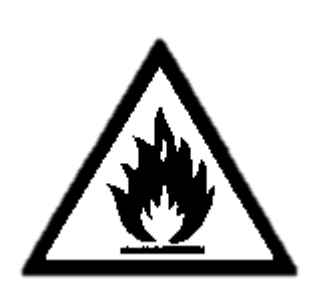
Danger of property damage